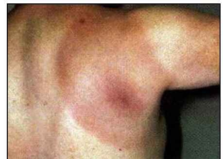
"Bull's Eye" Rash

Information Sources: CDC at: http://www.cdc/ncidod/dvbid/lyme/ and Calaveras County Cooperative Extension at: http://cecalaveras.ucdavis.edu/lyme.htm